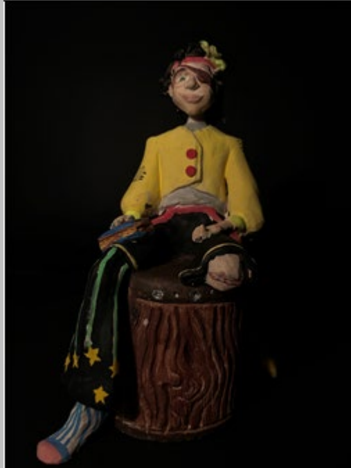
Zoe Speck Silver Key "Nomen Nescio"