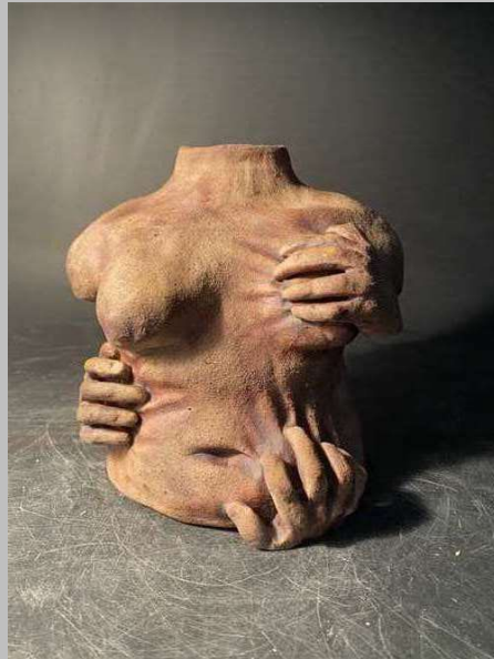
Celina Escamilla Gold Key "Self-Consolation"