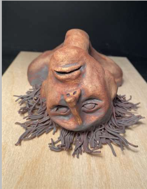
Reynaldo Banda Silver Key "Starting Again"