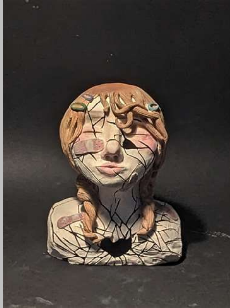
Celina Escamilla Honorable Mention "Isolation"