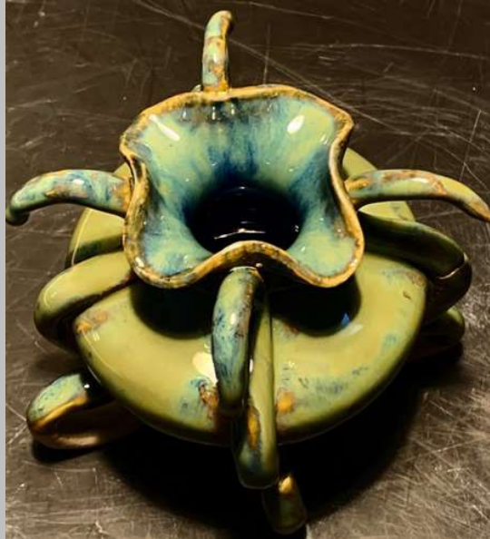
Eliza Brewer Honorable Mention "Girl In Blue"