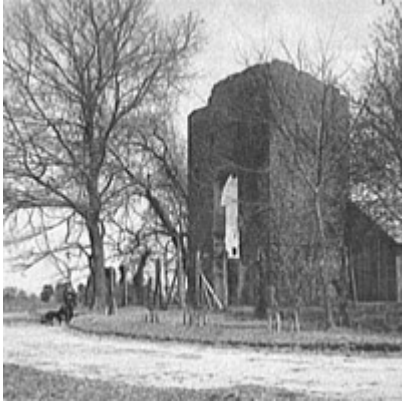
This 1639 church tower was one of the few remnants of the Jamestown Settlement visible in the 1890s, when the picture was taken

The Virginia Company of England made a daring proposition: sail to the new, mysterious land, which they called Virginia in honor of Elizabeth I, the Virgin Queen, and begin a settlement. One hundred twenty people made the voyage across the Atlantic. They established Jamestown, Virginia, on May 14, 1607, the first permanent British settlement in North America. Though determined, these settlers didn't know what severe challenges they would face.