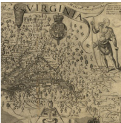
This map was created by Captain John Smith, showing the new settlement of Jamestown, Virginia

John Smith, adventurer and explorer. Despite the hardships, he kept the colony going with his solid leadership those first two years, as Jamestown grew to 500 with new arrivals from England. After he left in 1609, however, more trouble came.