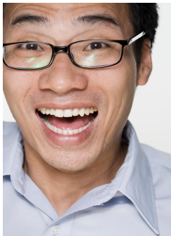
Happy hạnh phúc

As a result of labeling their feelings, children will learn a “feelings vocabulary”, this in turn will help them to problem solve, communicate feelings and maintain relationships with peers.