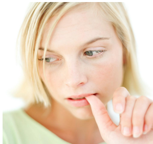
Worried lo lắng