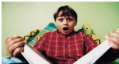
Surprised ngạc nhiên